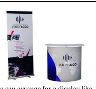
We can arrange for a display like this (roll-up + counter) to be printed in Avignon on your behalf at a cost of 500 euros (+VAT if applicable). Artwork must be provided by yourselves to the printer's specifications. If interested, please contact us asap.

<u>Suggestions</u>: 3m wide pop-up display or up to 3 standard roll-ups, with one small table and/or a counter, up to 3 chairs.